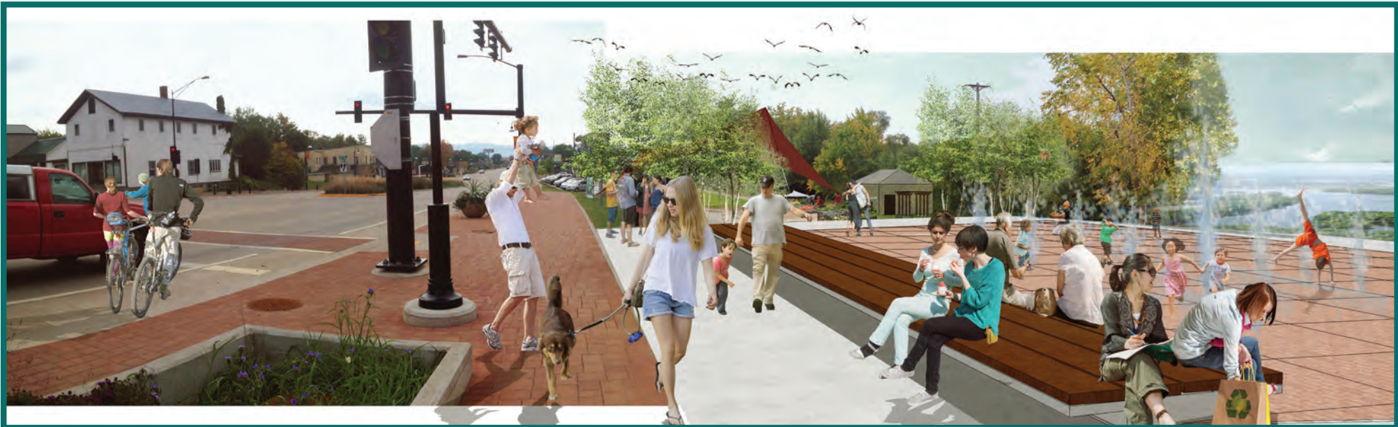
Illustration of an entry plaza at Main Street & State Road 35