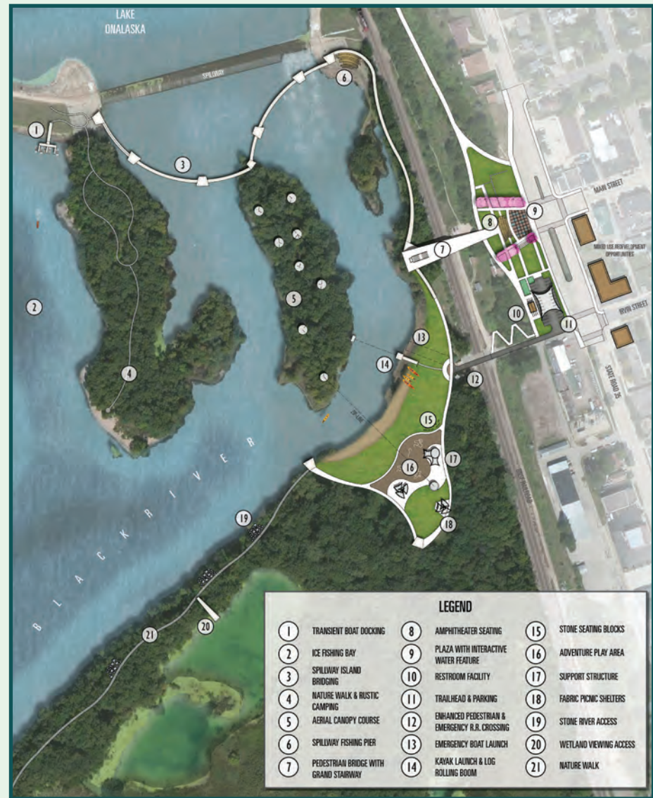
Consensus Plan for the Great River Landing